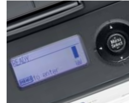
FRONT PANEL IS YOUR INFOLINE. AT-A-GLANCE, DETERMINE TONER LEVELS, PRINT JOB STATUS, AND OFFLINE CONDITIONS. THE INFOLINE-STYLE DISPLAY PROVIDES A VISUAL INDICATION—UP CLOSE AND FROM A DISTANCE—THE STATUS OF THE PRINTER.