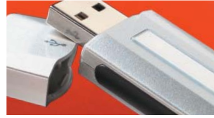
DIRECT PRINT QUICK. SEND PDF, XPS, JPEG AND TIFF FILES DIRECTLY TO THE PRINTER USING A USB FLASH DRIVE, PAGESCOPE WEB CONNECTION OR PAGESCOPE DIRECT PRINT UTILITY. ITS FAST AND CONVENIENT.